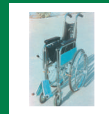
Folding wheel chair. We also make battery operated wheel chair with all movements controlled by one switch.