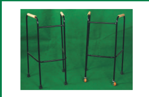
Walker Frames with and without wheels and also folding.