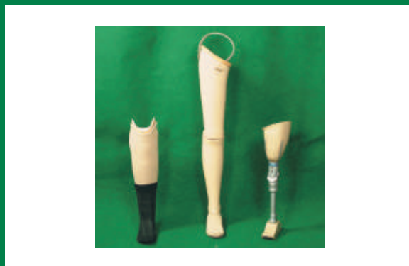
Below knee and above knee fibre glass prosthesis with each foot. Above knee modular prosthesis with squatting knee (extreme right).