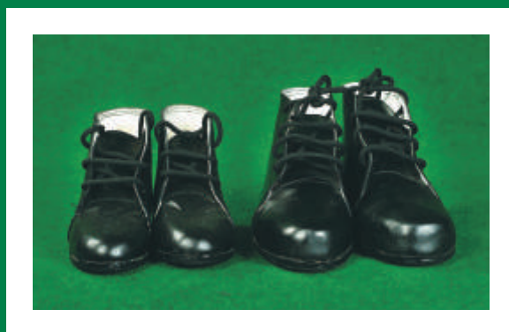
Orthopaedic boots for flat feet and club foot.