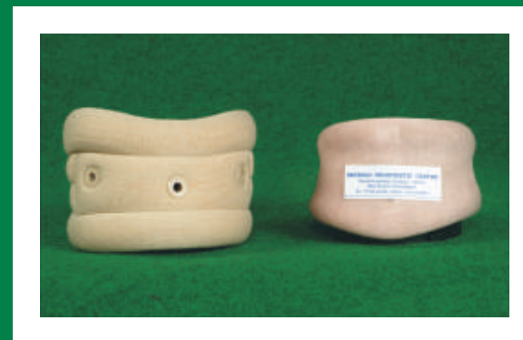
Cervical Collars, soft and hard, with velcro straps and washable cover.