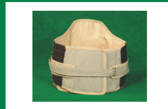
Lumbo Sacral belt with plastic moulded back support plate and velcro straps.