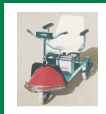
Tri-cycle battery operated.