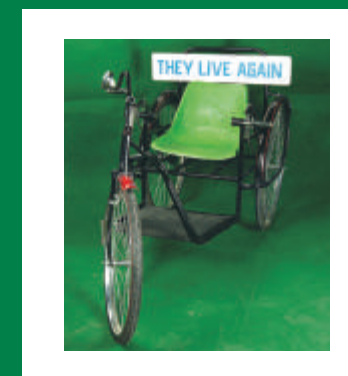
Tri-cycle, deluxe model with fibre glass seat.