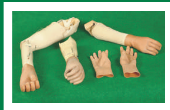
Above elbow and below elbow prosthesis and cosmetic gloves. We manufacture and fit electronic and mechanical hands.