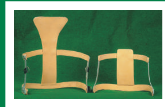
Taylor's Brace and L.S. Brace