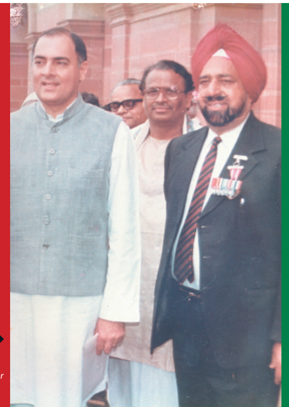
With Mr Rajiv Gandhi Former Prime Minister of India.