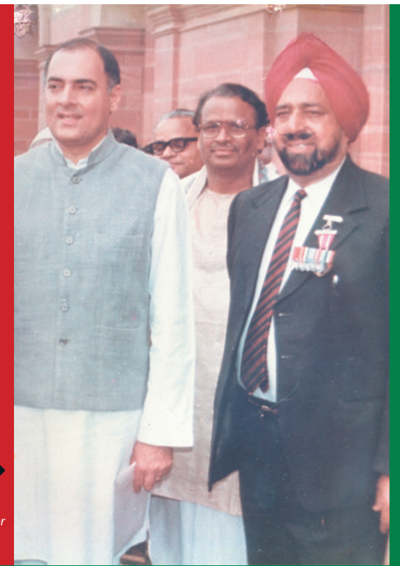
With Mr Rajiv Gandhi Former Prime Minister of India.