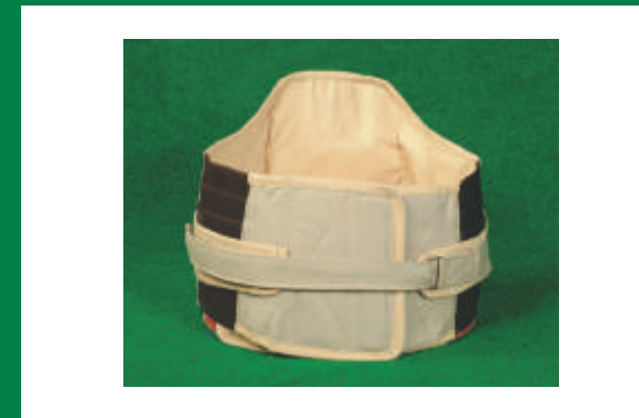
Lumbo Sacral belt with plastic moulded back support plate and velcro straps.