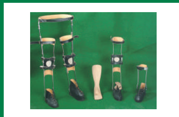
Walking Calipers, Braces and Splints for lower limbs.