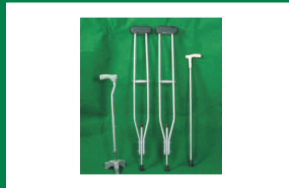
Aluminium Crutches and Sticks (including adjustable).